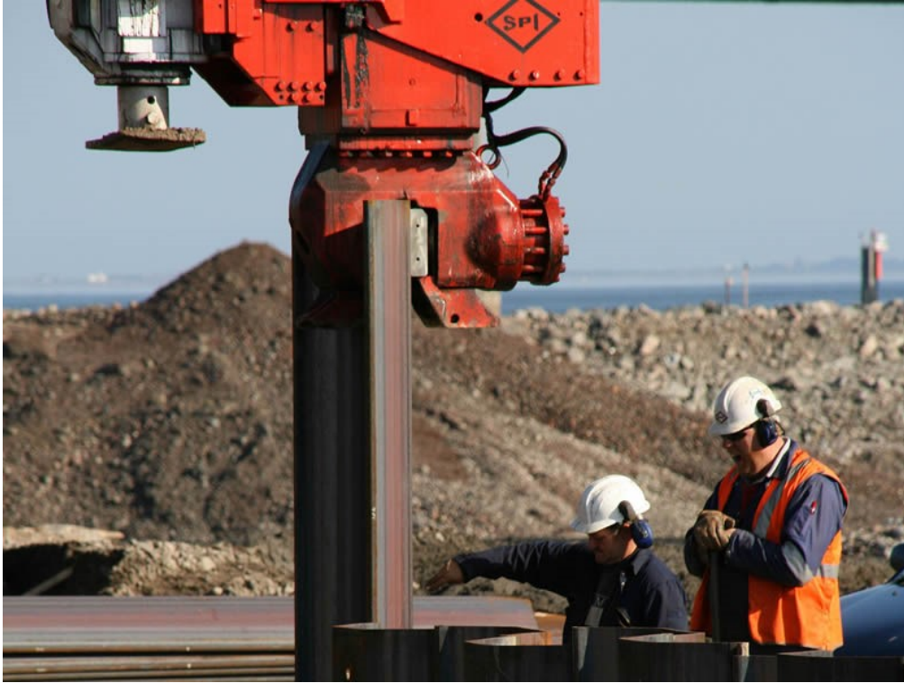
The Piles going down with the Vibratory Hammer