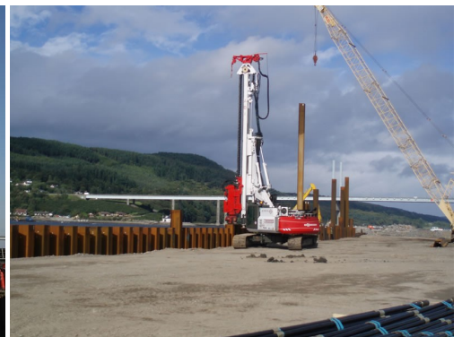
13/16 Leader Rig with Vibratory Hammer