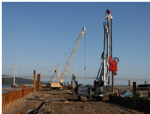
Piling Works Underway