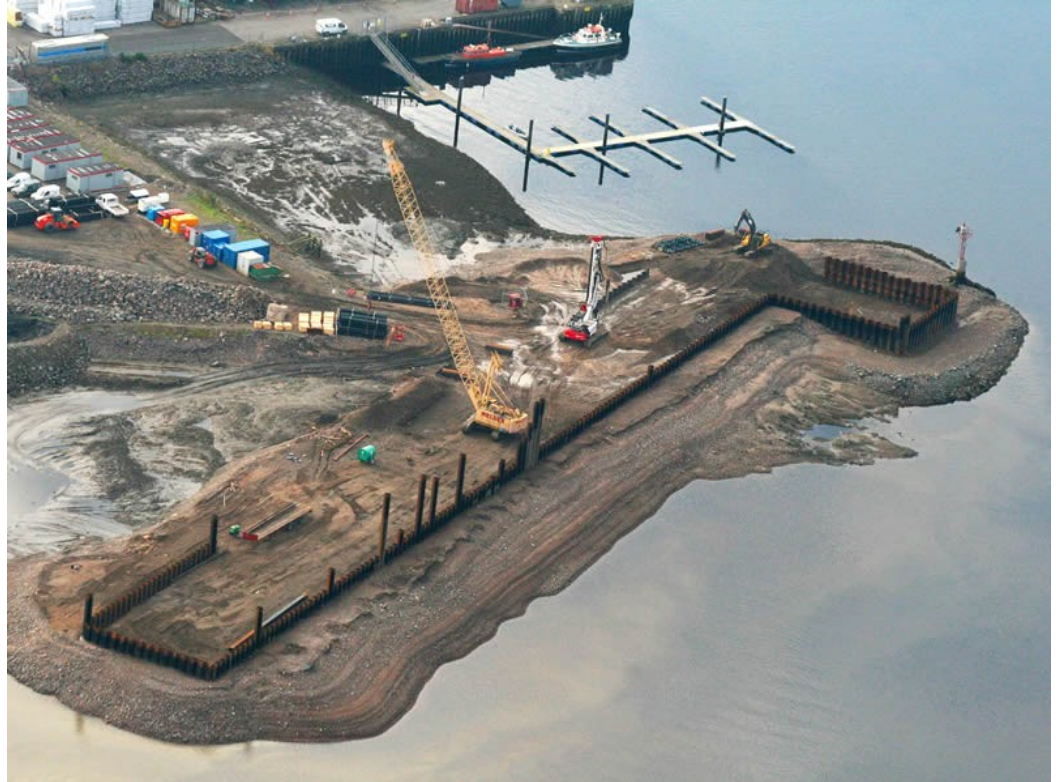
Aerial view of works underway at Inverness Harbour

Summary: We were asked to install permanent sheet piles to facilitate the construction of an extension to the existing harbour wall to form a new quay and marina.