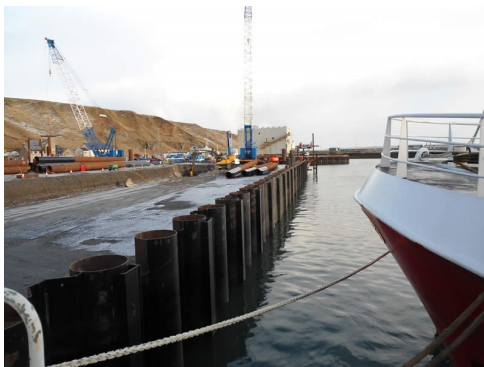
Combi Wall at Scrabster

The final result now gives a heavy lift area for offloading larger vessels which was the aim of the project.