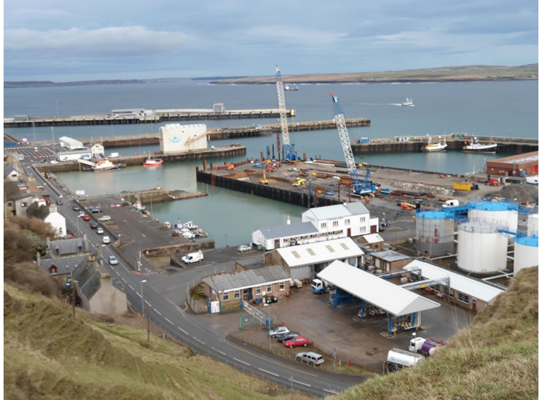
Aerial view at Scrabster

We were asked to install a permanent combi wall for the new alignment of the quayside at Scrabster.