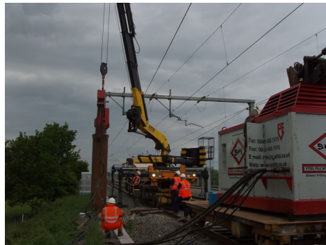
Piling using the specialist rail equipment