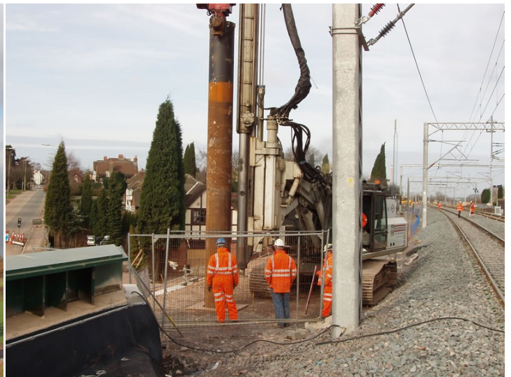
Working close to residential properties