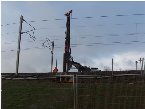
13/16 Leader Rig working by the track