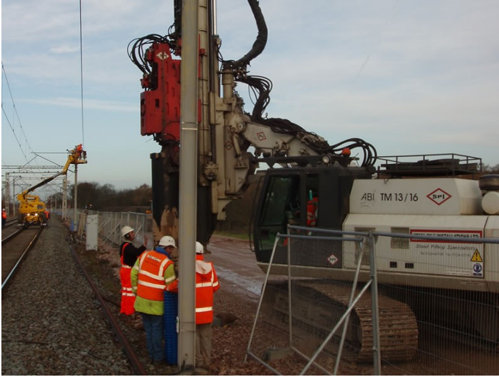
Trackside working under possession