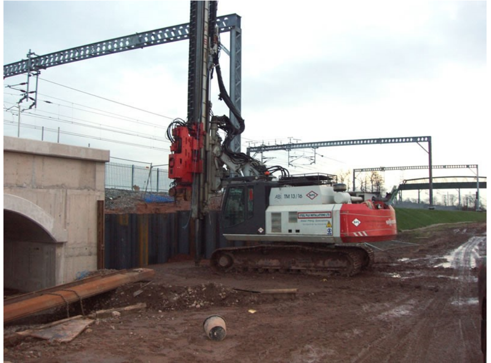
13/16 Leader Rig working at Trent Valley

Our works formed part of the new Trent Valley 4 Tracking Scheme to widen the West Coast Main Railway Line to four tracks between Tamworth and Lichfield for Network Rail.