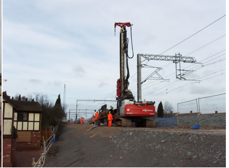
Trent Valley works under possession